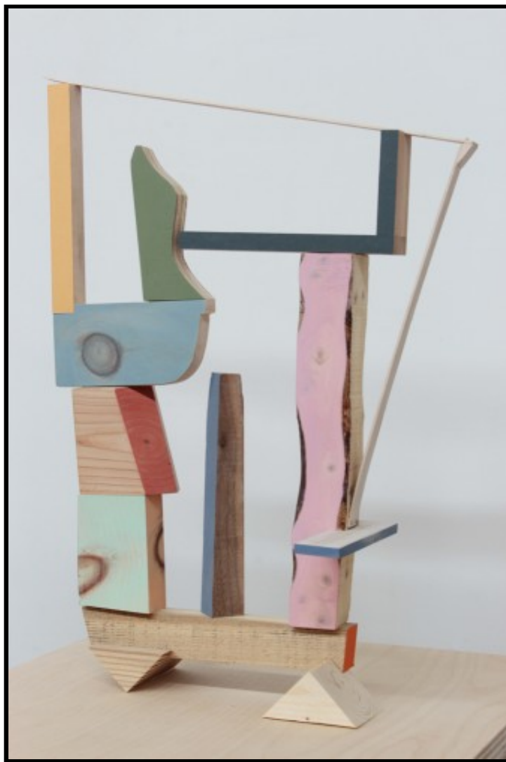
Jim Osman, Allowance , wood, paint, paper, 18x13x5 inches, 2014

Matthew Deleget's system-based Shuffle (2010) presented something tantamount to four monochromes trying to exist within the same space, each jostling out the other. Focusing on any one of the painting's four sets of four colors called them up to the foreground, only to be superseded by another with a shift in gaze.